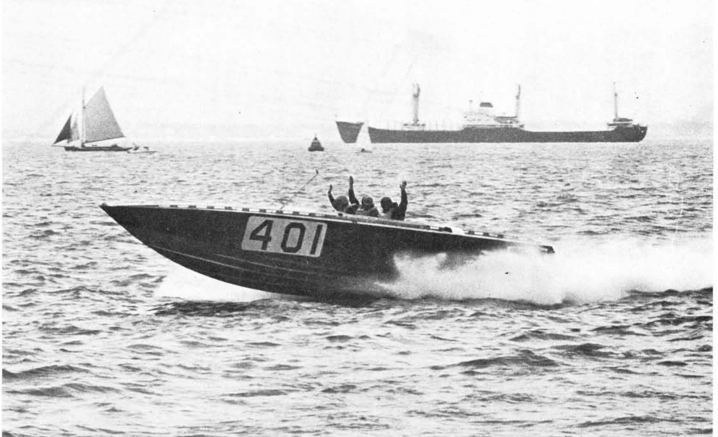
Opposite: Weaving through the spectator fleet shortly after the start. Recognisable boats include Psychedelic Surfer (343), Screwdriver (246), Meteor III (250), Gee (185), Snoopy (044), Thunderstreak (955), Miss Bovril (289), and Fordpower (808).